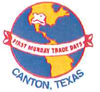
Plate 4-1 City of Canton, Texas Future Land Use Plan

NOTE: A Comprehensive Plan shall not constitute zoning regulations or establish zoning district boundaries.